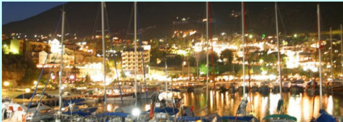
Kalkan at Night