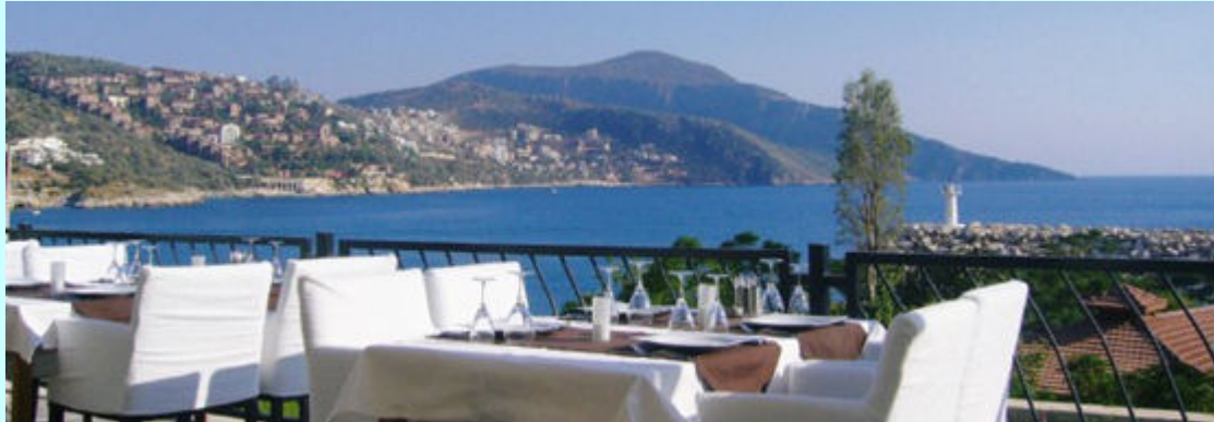
View from a roof Restaurant