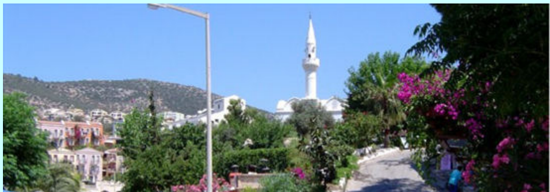
Mosque in the Old Town