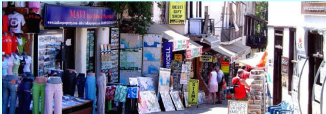
Shopping in the Old Town