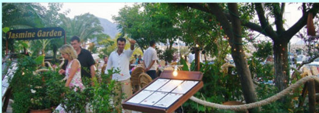
Typical Harbour front Restaurant